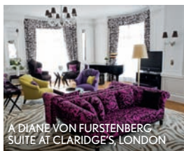
A DIANE VON FURSTENBERG SUITE AT CLARIDGE'S, LONDON