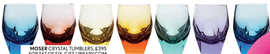
MOSER CRYSTAL TUMBLERS, £395 FOR SET OF SIX, GIFT-LIBRARY.COM