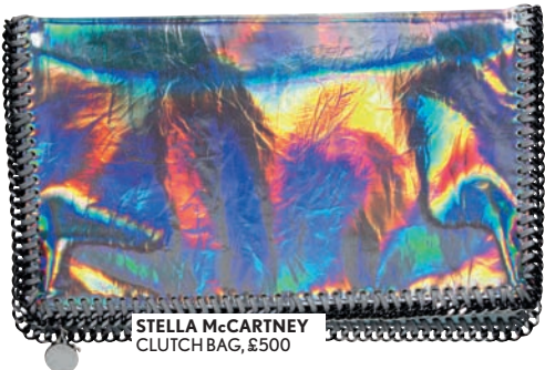
STELLA McCARTNEY CLUTCH BAG, £500

She is Wearing The Antoni & Alison 'Plain - Fancy' Dress.