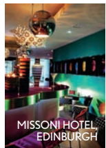
MISSONI HOTEL EDINBURGH

Who wouldn't want to enjoy a room of dramatic colour in Edinburgh? Relax on a plum sofa in London? Or lie back on a neon sunlounger in Panama? Take an energising trip by booking into the world's most poptastic hotels .