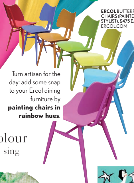
ERCOL BUTTERFLY CHAIRS (PAINTED BY STYLIST), £475 EACH, ERCOL.COM

Turn artisan for the day: add some snap to your Ercol dining furniture by painting chairs in rainbow hues .