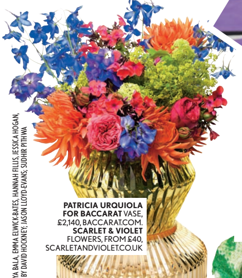
PATRICIA URQUIOLA FOR BACCARAT VASE, £2,140, BACCARAT.COM. SCARLET & VIOLET FLOWERS, FROM £40, SCARLETANDVIOLET.CO.UK

Turn artisan for the day: add some snap to your Ercol dining furniture by painting chairs in rainbow hues .