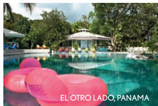
EL OTRO LADO, PANAMA

Immerse yourself in David Hockney's key Sixties works at A Bigger Splash : Painting After Performance (Tate Modern, November 14 to April 1), which also features artists from Jackson Pollock to Cindy Sherman.