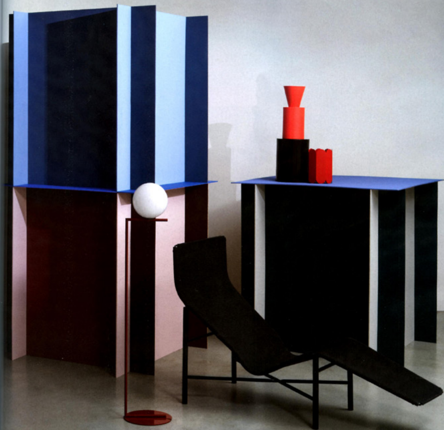
Paint on panels, from top left, top cube 'Tommaso's Periwinkle' (stripes), from £27 for 1 litre, Francesca's Paints ( francescaspaint.com ). 'Indigo', £18 for 0.75 litre, Graphenstone ( graphenstone-ecopaints.store ). 'Egyptian Indigo' (dividing left-hand structure), from £39 for 1 litre, Andrew Martin ( andrewmartin.co.uk ). 'Cardinal' (bottom cube), from £35 for 1 litre, Francesca's Paints ( francescaspaint.com ). 'Avantgarde 64' (stripes), from £49.50 for 5 litres, Keim ( keimpaintshop.co.uk ) Right cube 'Avantgarde 190' (tabletop), from £49.50 for 5 litres, Keim ( keimpaintshop.co.uk ). 'Borough Market', from £27 for 1 litre, Mylands ( mylands.com ). 'Stone-Pale-Cool' (stripes), from £24.50 for 1 litre, Little Greene ( littlegreene.com ) From left 'IC F2 Outdoor' floor light in 'Burgundy', by Michael Anastassiades, £731, Flos ( flos.com ). Vintage 1960s chaise longue by Tord Björklund for Ikea, £970, Monument Store ( monumentstore.co.uk ). Scultura F5 sculpture by Nathalie Du Pasquier for Bitossi, £990, Monologue London ( monologuelondon.com ). 'Arcs' vase in 'Red', by Muller Van Severen, £119, Hay ( hay.dk )