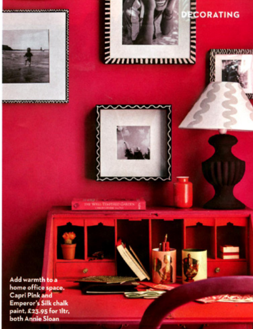
Add warmth to a home office space. Capri Pink and Emperor's Silk chalk paint, £23.95 for 1ltr, both Annie Sloan