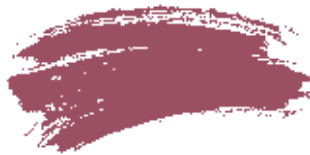
Tiger Rose, £42 for 2.5l Low Sheen Emulsion, Konig Colours