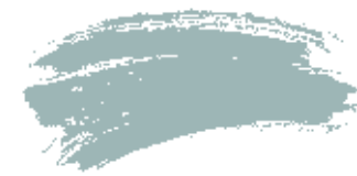
Lulworth Blue, £45 for 2.5l Estate Emulsion, Farrow & Ball

TOP ROW FAR LEFT The big blue Infinite shades of blue from the ocean never cease to inspire and entice. It is a colour that is eminently usable and works well in all sorts of patterns. This collection of papers has a gently textured quality. Selection of wallpapers, from £155 a roll, Thibaut