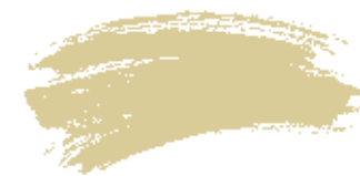
Stone Pale Cool, £43.50 for 2.5l Absolute Matt Emulsion, Little Greene

TOP ROW LEFT Floral arrangement Though the palette is coastal inspired, it does not mean a nautical theme has to be adhered to. Blues look lovely on floral designs, the gentle colour allowing for confident use of large-scale pattern. Folk Floral, denim blue, £9.99 a roll, Arthouse