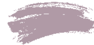
Chalk Violet, £39.50 for 2.5l Matt Emulsion, Fired Earth

From purple-heather-strewn hillsides to grassy green moors and the ever-changing hues of the heart-lifting huge expanses of sky, the wild landscapes of Britain's moorlands provide plenty of colour inspiration.