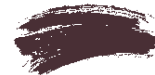
Brinjal, £45 for 2.5l Estate Emulsion, Farrow & Ball