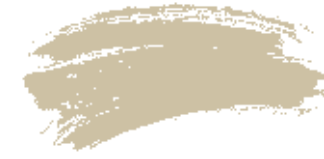
Sand V, £48.50 for 2.5l Pure Flat Emulsion, Paint & Paper Library

MIDDLE FAR LEFT Perfect pairing Navy and sea blues combine perfectly with sandy tones – as one would expect. A neutral beige provides a gentle contrast than crisp whites for a softer, modern partnership. Selection of fabrics from the Heritage Collection, Clarke & Clarke