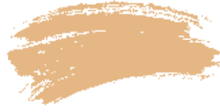
Old Gold, £12.50 for 2.5l Matt Emulsion, Coloured Emulsion Collection, Crown