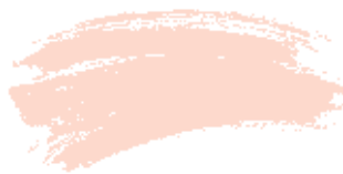
Palmerston Pink, £46, for 2.5l Marble Matt Emulsion, Mylands