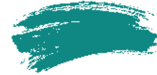
Magical Malachite, £25.20 for 2.5l Premium Blend v700, Valspar at B&Q

Kilnsey in Rhodolite, £55.95 a metre, Elemental Collection, Moon