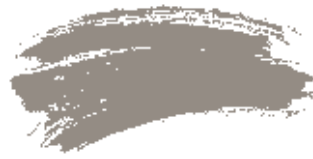
Mouse Grey, £46 for 2.5l Matt Emulsion, Atelier Ellis