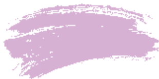
Daydream Believer, £25.20 for 2.5l Premium Blend v700, Valspar at B&Q