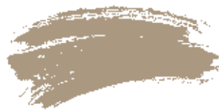
Little Rascal, £40 for 2.5l Flat Matt Emulsion, Claypaint Tinted Colours Collection, Earthborn

Capture the warmth of fields of corn, mellow stone cottages, lichen and moss, ancient timbers and the soft earth tones on undulating tilled farmland for a soothing colour scheme to set a perfectly calm yet inviting backdrop to the everyday.