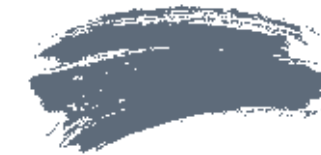
Navy Blue, £45 for 2.5l Emulsion, Edward Bulmer Natural Paint

Bespoke cushions (top to bottom): Buffalo in Wild, £254 a metre; Karoo in Ivory, £230 a metre; Shukka in Swan, £216 a metre, all de Le Cuona