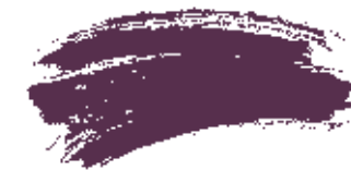
Meadow Violet, £43 for 2.5l Active Emulsion, Sanderson

Walls up to picture rail, Grenache, £48.50 for 2.5l Pure Flat Emulsion; woodwork, Grenache, £66.50 for 2.5l Architects' Eggshell; walls above picture rail, Lady Char's Lilac, £53.50 for 2.5l Architects' Matt, all Paint & Paper Library