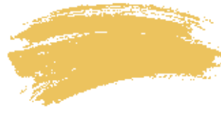
Yellow Ground, £45 for 2.5l Estate Emulsion, Farrow & Ball