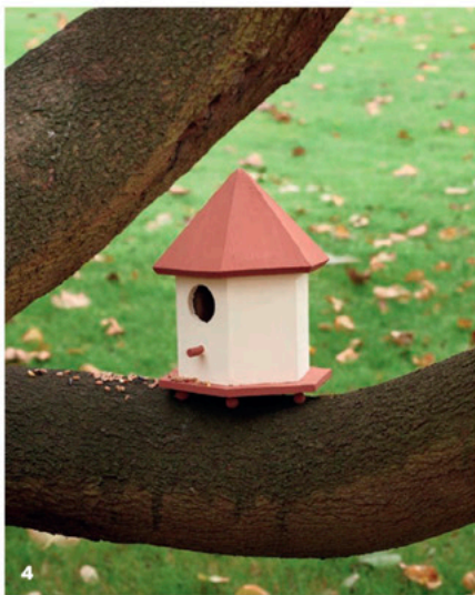
1 Bracket: 'Sage and Onions'; roof: 'Edith's Eye'; walls: 'Puck'; all Absolute Matt Emulsion, £43.50, Little Greene. 2 Roof: 'Mikado'; walls: 'Capri'; windows: 'Lemon'; all Absolute Matt Emulsion, by Patrick Baty, £46.80, Papers and Paints. 3 Roof: 'Coeur d'Artichaut'; walls: 'Ciel Belge Foncé'; both Extra Matt Acrylic, by Agnès Emery, £24 approx per kilo, Emery & Cie. 4 Roof: 'Song de Boeuf'; walls: 'White Lead'; both Natural Paint, £45, Edward Bulmer. Prices are for 2.5 litres, unless otherwise stated, and include VAT. For suppliers' details see Address Book