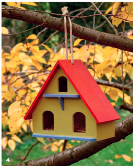
1 Roof: 'Soft Ash'; walls: 'Spring Bud'; both Matt Emulsion, £14, Crown. 2 Roof: 'JW8'; walls: 'JW6'; windows: 'Turmeric'; all Eco Emulsion, from £39.41, Francesco's Paints. 3 Roof (left): 'Rainlake'; roof (right): 'Squirrel'; walls: 'Balmory Blue'; all Active Emulsion, by Sanderson, £45, Style Library. 4 Roof: 'Flame Red'; walls: 'Greengage'; ledges: 'Vintage Denim'; all Perfect Matt Emulsion, £45, Designers Guild. Prices are for 2.5 litres and include VAT. For suppliers' details see Address Book