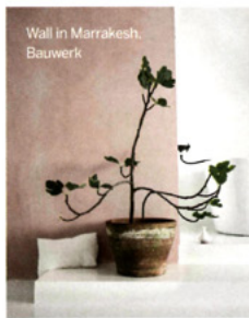
Wall in Marrakesh, Bauwerk