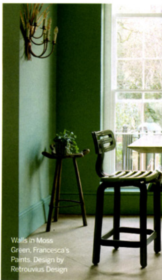
Walls in Moss Green. Francesca's Paints. Design by Retrouvius Design