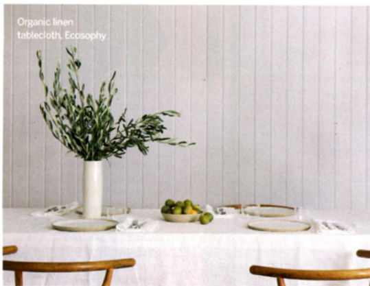
Organic linen tablecloth, Ecosophy