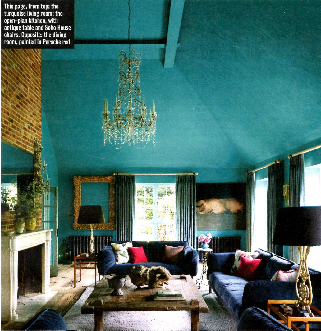
This page, from top: the turquoise living room; the open-plan kitchen, with antique table and Soho House chairs. Opposite: the dining room, painted in Porsche red