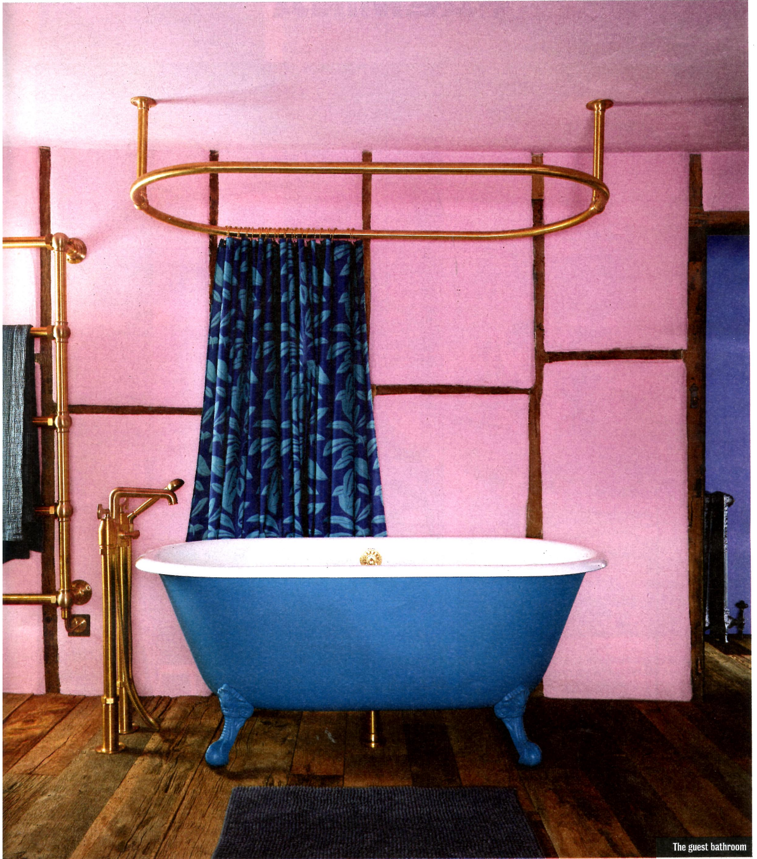
The guest bathroom