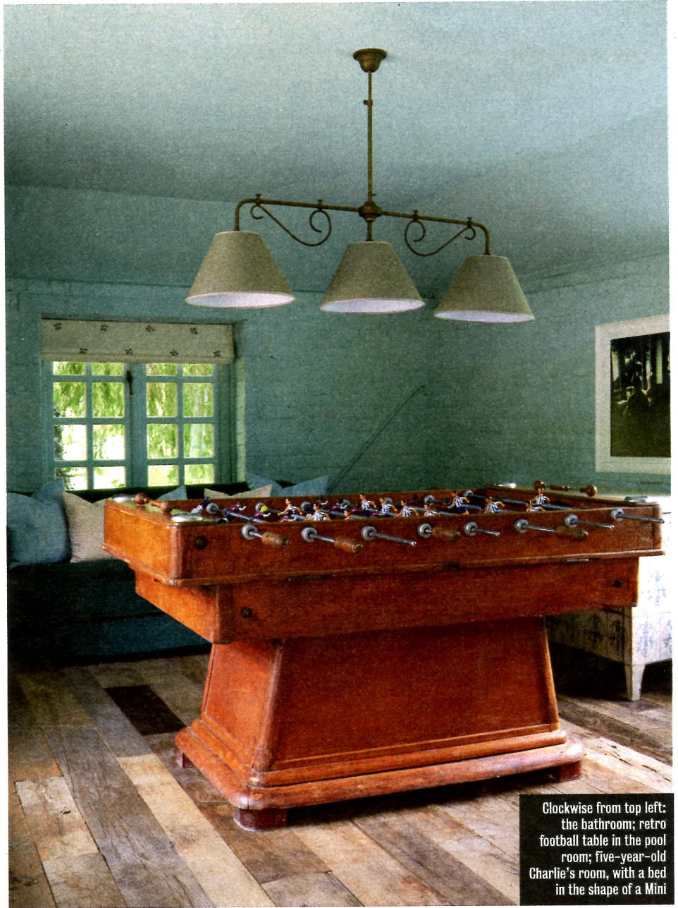
Clockwise from top left: the bathroom; retro football table in the pool room; five-year-old Charlie's room, with a bed in the shape of a Mini

had lived in it for more than 20 years, "so everything needed redoing," she says, "from the floors and heating to the electrics and plumbing. In short, a total renovation."