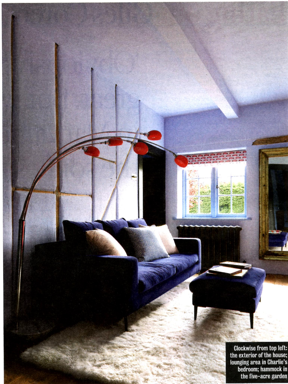
Clockwise from top left: the exterior of the house; lounging area in Charlie's bedroom; hammock in the five-acre garden

She has always collected antiques. They are scattered around the house: a pale blue-painted Swedish chest of drawers and a grandfather clock in the kitchen; a pair of wooden wheeled trolleys from Switzerland in the playroom; an old French font, which she has converted into a basin for the guest loo; a retro English football table in the pool room.