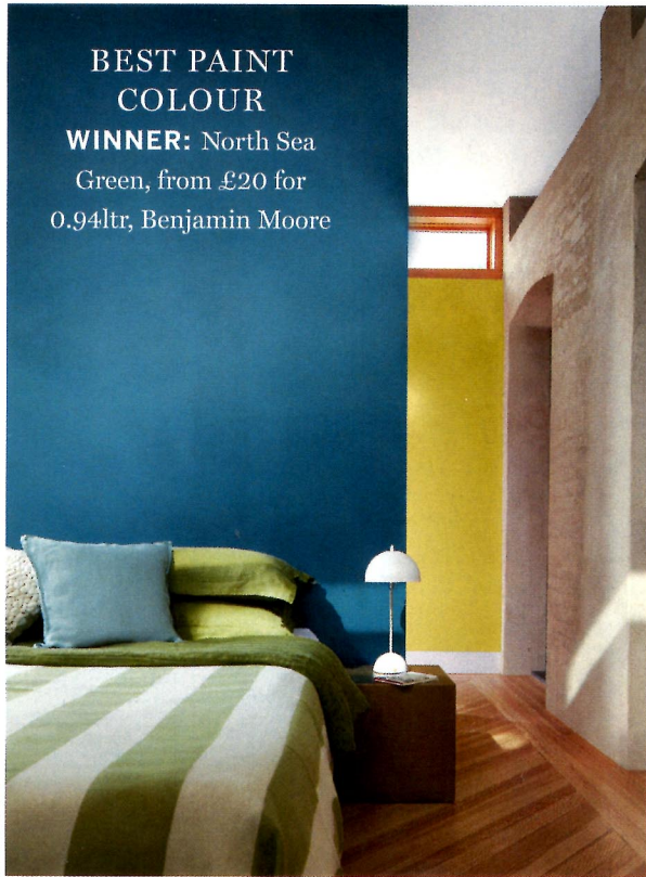
BEST PAINT COLOUR WINNER: North Sea Green, from £20 for 0.94ltr, Benjamin Moore