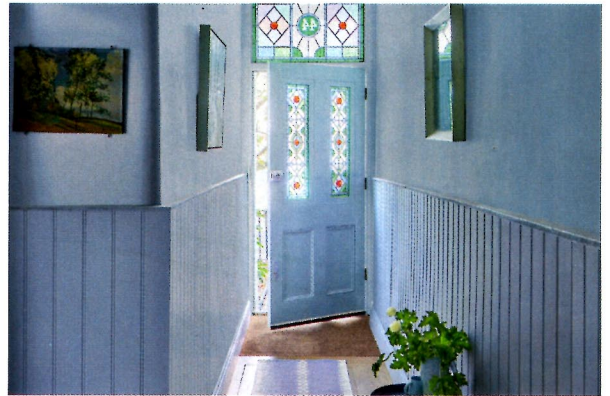
BEST PAINT FINISH WINNER: Dead Flat, £75 for 2.5ltr, Farrow & Ball