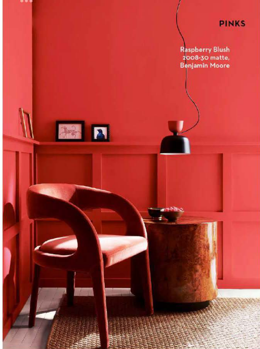
Raspberry Blush 2008-30 matte, Benjamin Moore