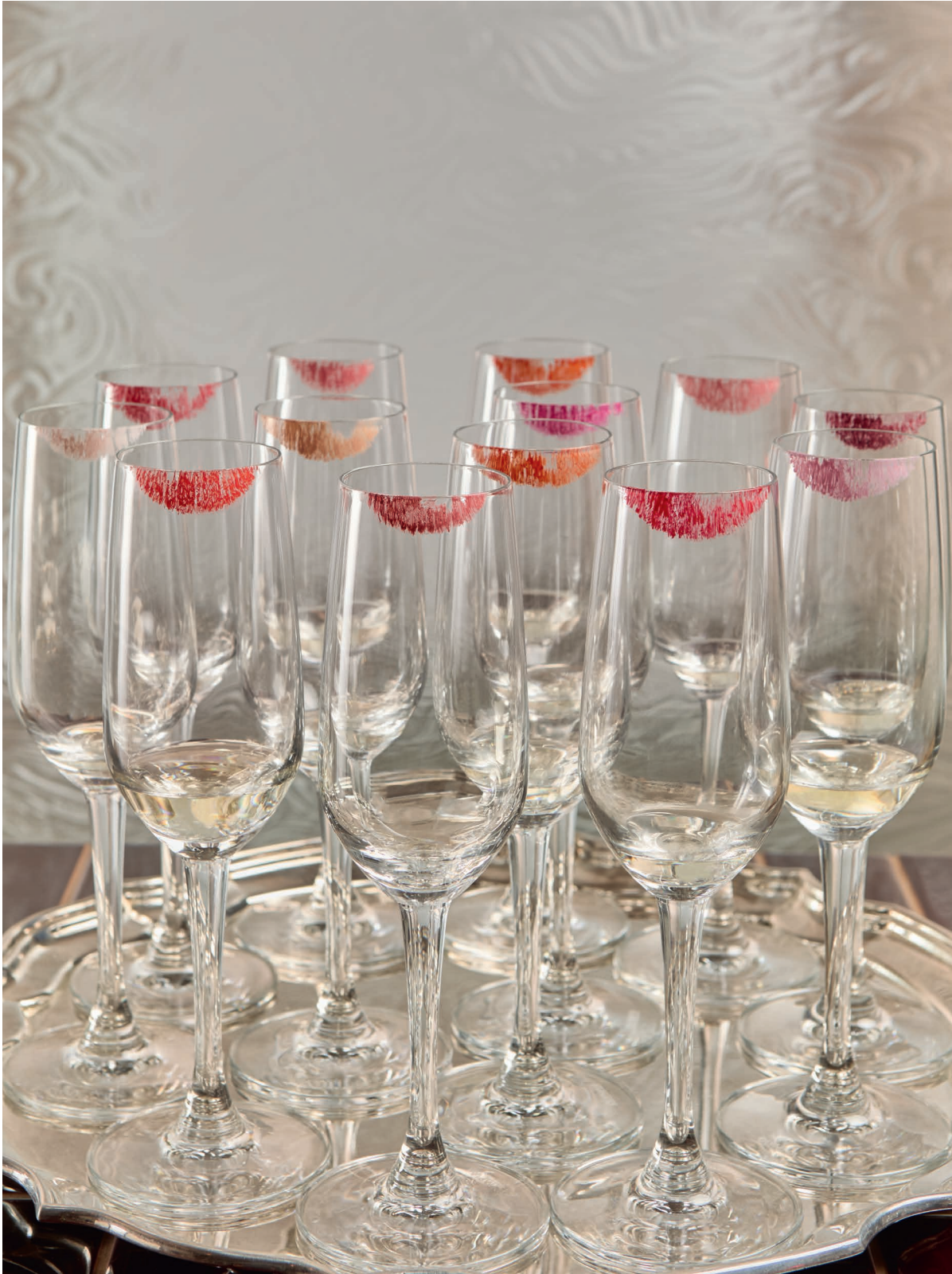
Outer circle, clockwise from left: 'Pink Powderpuff', £20.75 per 0.94 litres, Benjamin Moore. 'Arts Club', £68, Mylands. 'Ramsbury Red', £58, Susie Watson Designs. 'Atlas', £70, Paint and Paper Library. 'Garlic Prawn', £65, William Yeoward. 'Nasturtium', £59, House of Hackney. 'Madame Butterfly', £59, Designers Guild. 'Wimpole Poppies', £60, M&L. 'Covent Garden Floral', £68, Mylands. 'Verbena', £59, House of Hackney. Inner trio, from left: 'Hespan', £66, Edward Bulmer Natural Paint. 'Koi Carp', £59, Zoffany. 'Mischief', £70, Little Greene